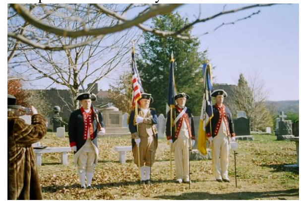
Congressional Cemetery-Washington D.C. November 2008